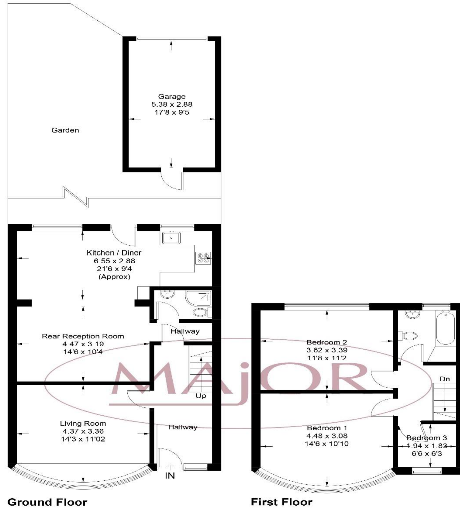
Illustration for identification purposes only, measurements are approximate, not to scale. floorplansUsketch.com © (ID1075198)

Major Estates Harrow LTD ~ 77 High Street, Wealdstone, Harrow, HA3 5DQ T: 020 8424 8686 ~ E: sales@majorestate.com ~ www.majorestate.com