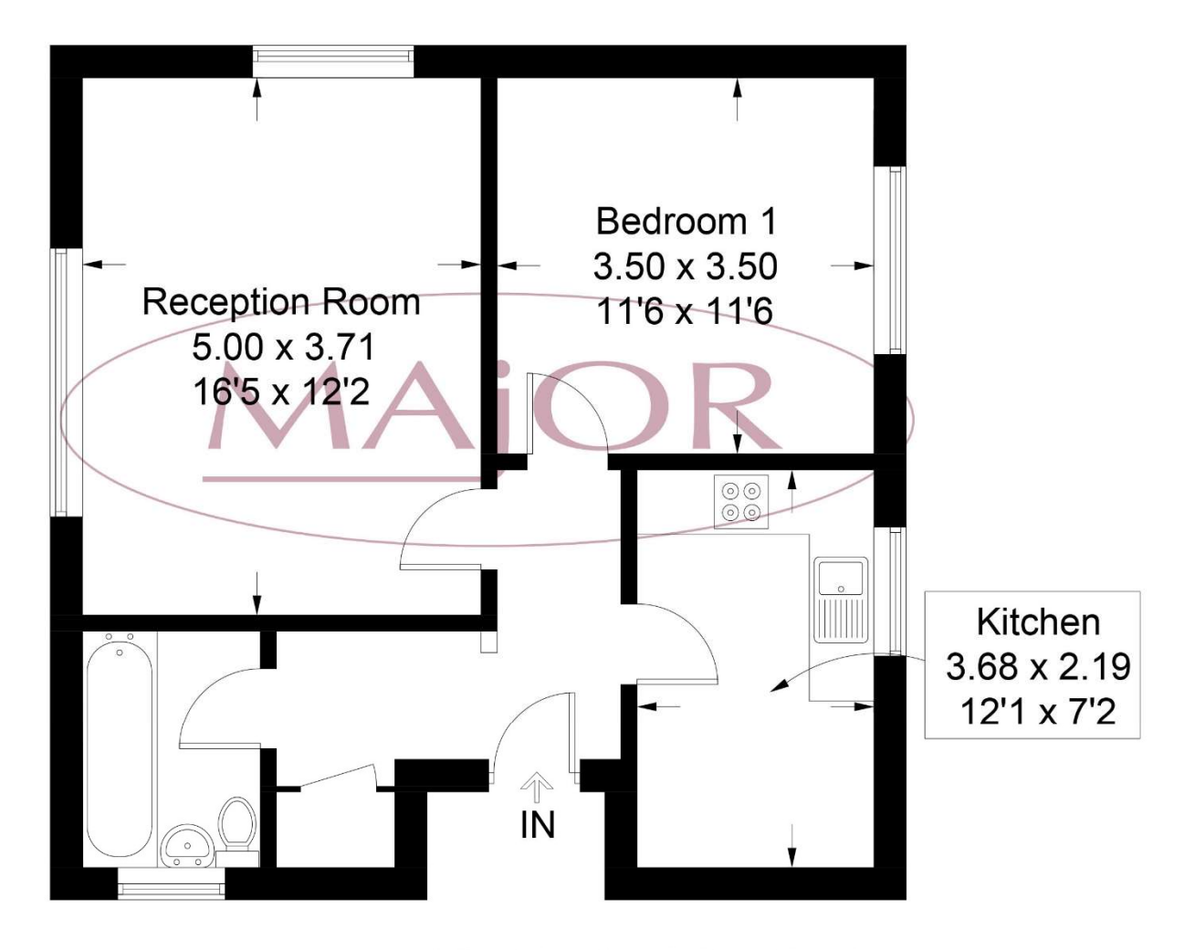
Approximate Gross Internal Area = 51.8 sq m / 557 sq ft

Illustration for identification purposes only, measurements are approximate, not to scale. Fourlabs.co © (ID1190293)