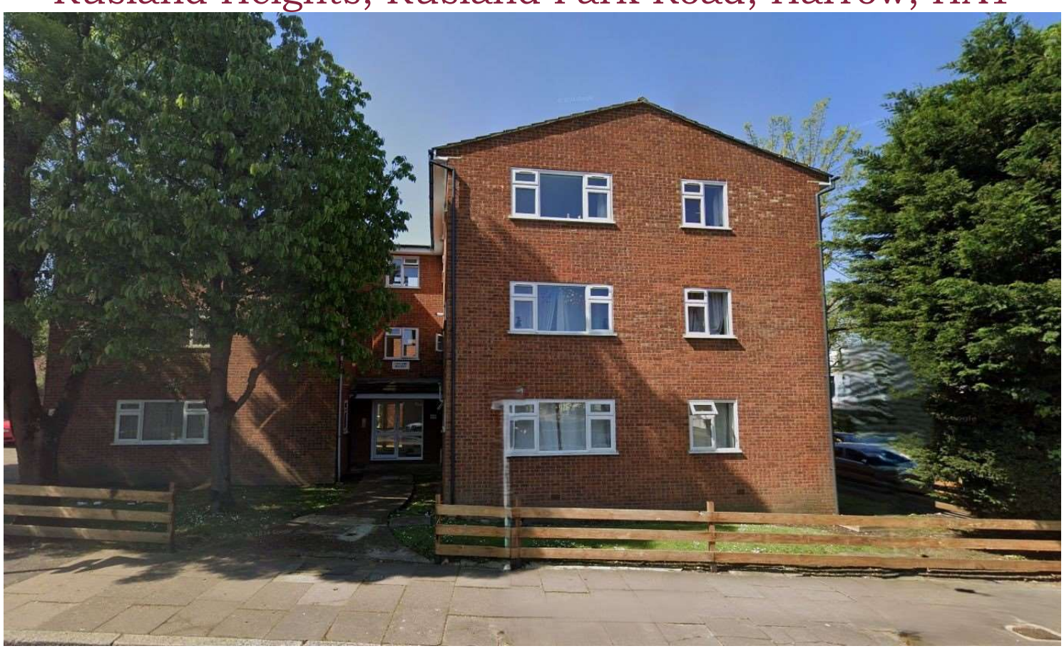
FOR SALE £240,000 Leasehold

Rusland Heights, Rusland Park Road, Harrow, HA1