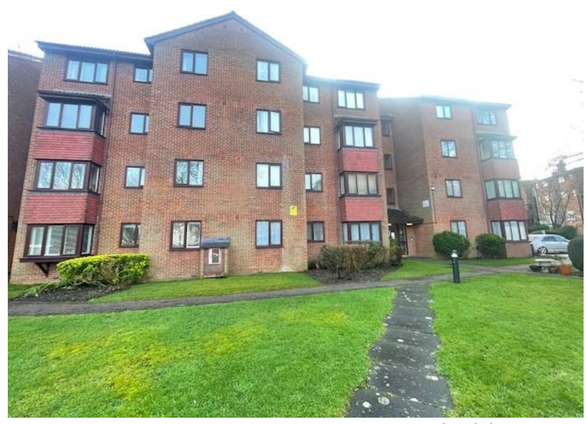
FOR SALE £110,000 Leasehold

Major Estates Harrow LTD ~ 77 High Street, Wealdstone, Harrow, HA3 5DQ T: 020 8424 8686 ~ E: sales@majorestate.com ~ www.majorestate.com