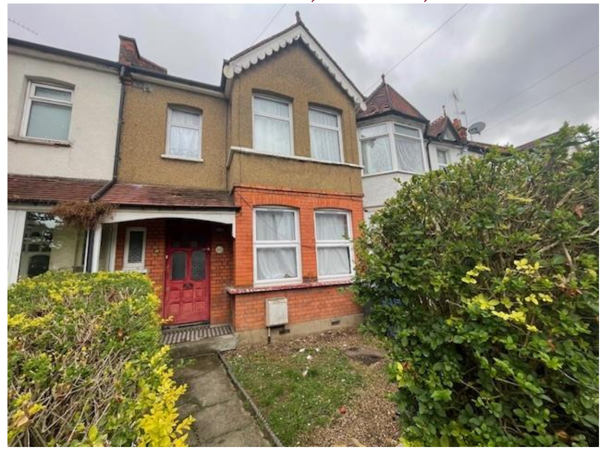
FOR SALE £250,000 Leasehold

Major Estates Harrow LTD ~ 77 High Street, Wealdstone, Harrow, HA3 5DQ T: 020 8424 8686 ~ E: sales@majorestate.com ~ www.majorestate.com