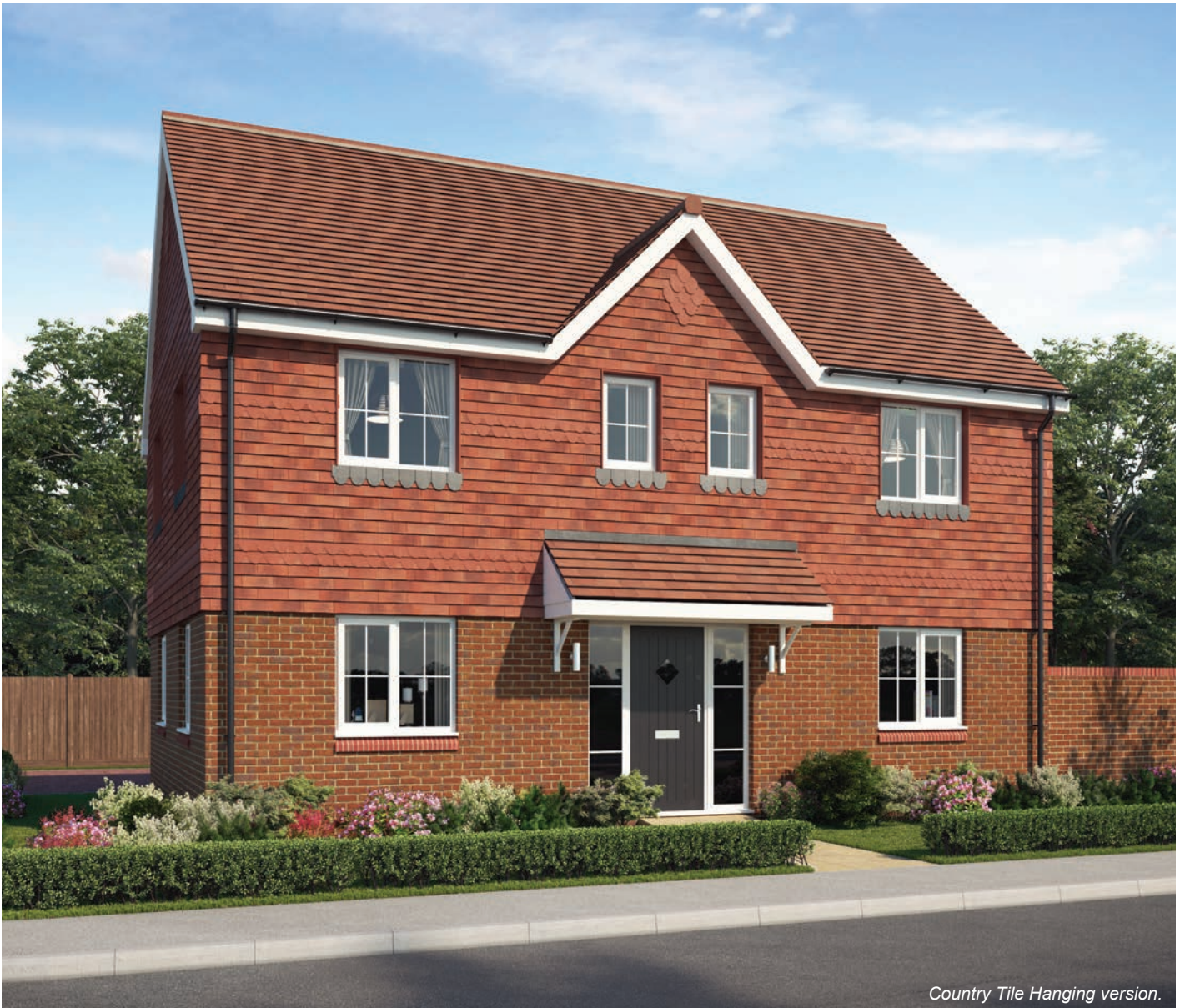
Country Tile Hanging version.