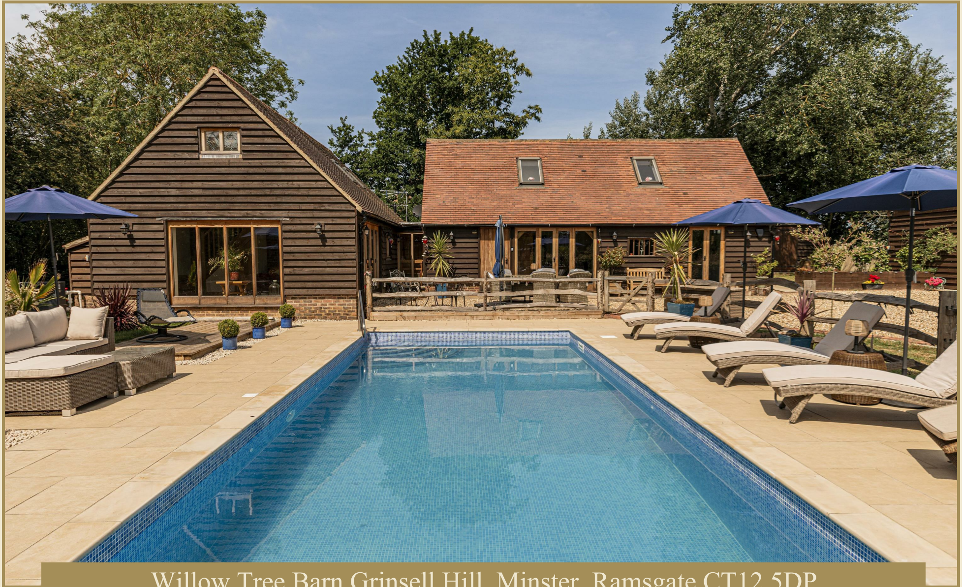
Willow Tree Barn Grinsell Hill, Minster, Ramsgate CT12 5DP