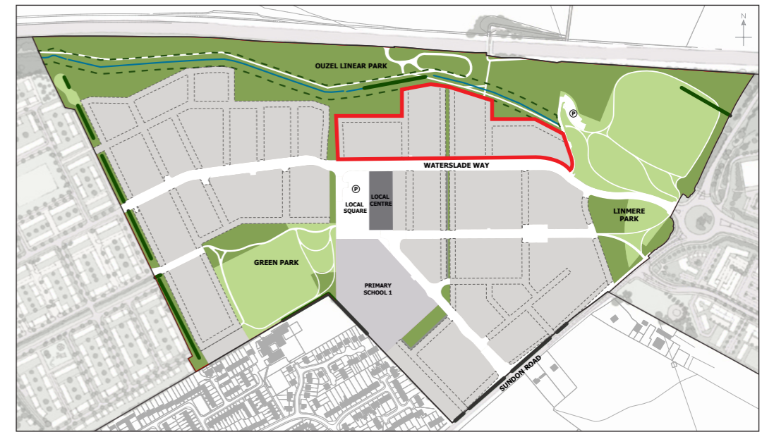
Linmere Area Masterplan