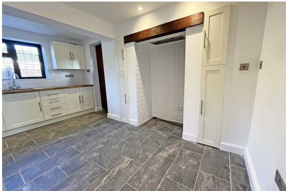
Kitchen/ Breakfast Room 14'0 max x 13'0 max (4.27m max x 3.96m max)