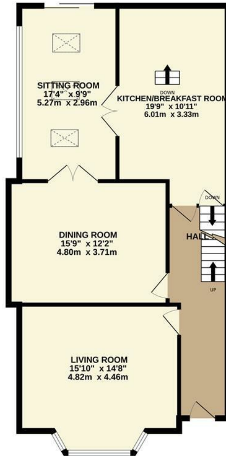
1ST FLOOR 733 sq.ft. (68.1 sq.m.) approx.