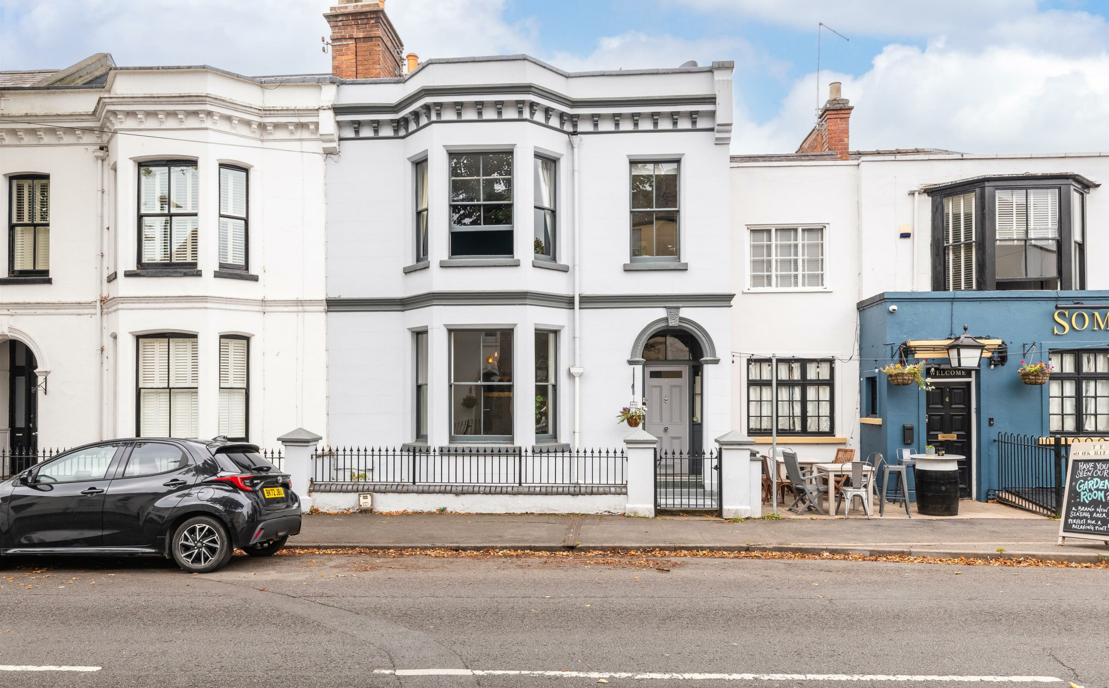
6 Champion Terrace, Leamington Spa, CV32 4SX Guide Price £625,000