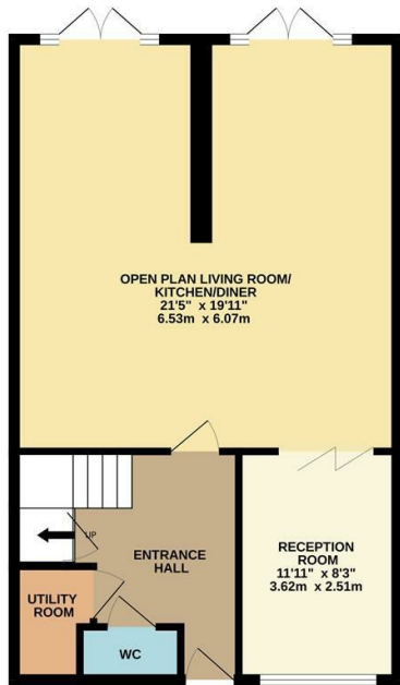
GROUND FLOOR 651 sq.ft. (60.5 sq.m.) approx.