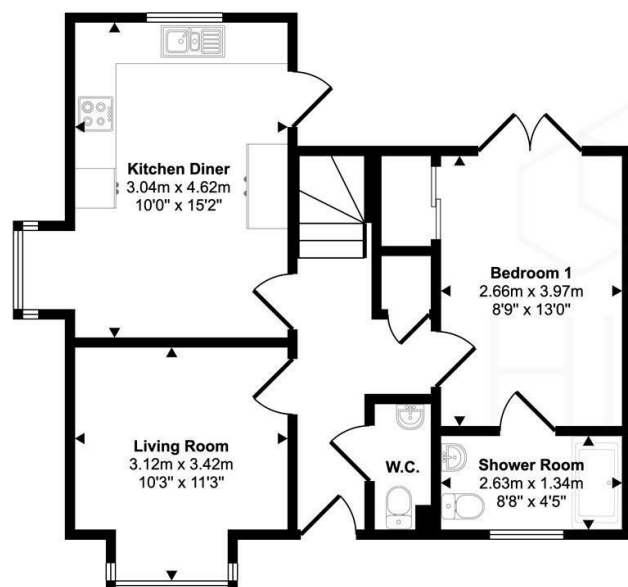
Ground Floor Approx 52 sq m / 560 sq ft

Approx Gross Internal Area 96 sq m / 1035 sq ft