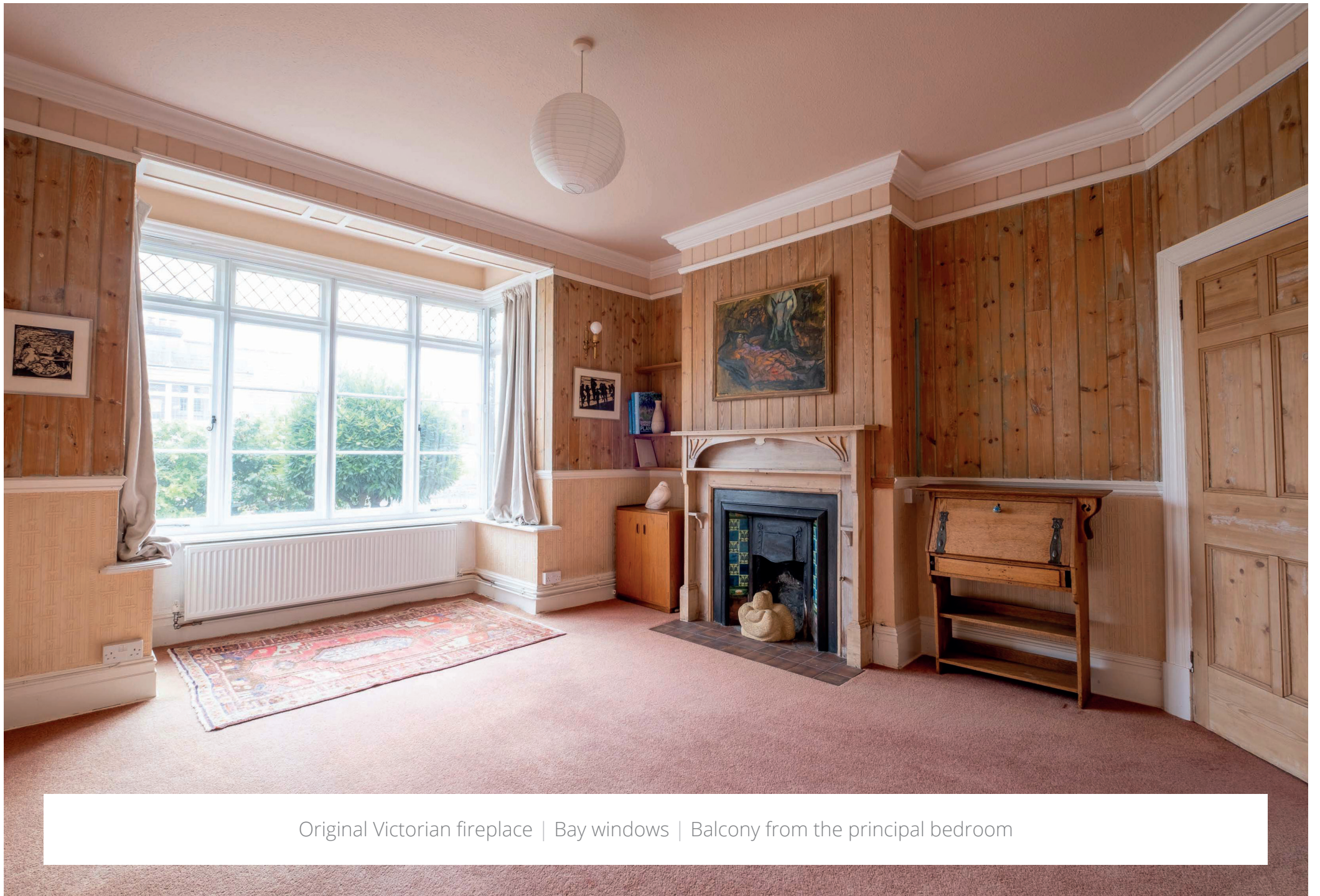
Original Victorian fireplace | Bay windows | Balcony from the principal bedroom