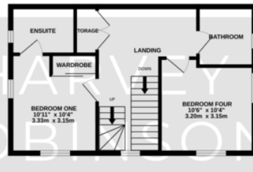
1ST FLOOR 436 sq.ft. (40.5 sq.m.) approx.