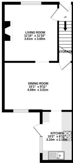
GROUND FLOOR 390 sq.ft. (36.2 sq.m.) approx.