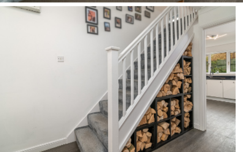
Heritage Way, Raunds, NN9 6RX