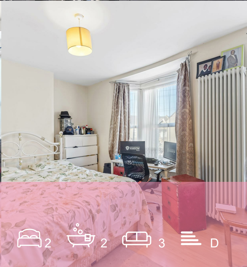
The Crescent , London, E17 8AB Offers in excess of £650,000