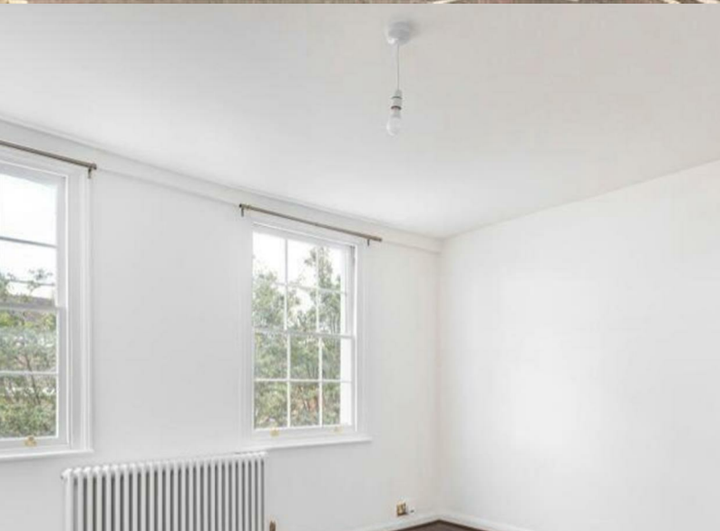
Chart Street , London, N1 6DH £5,995 Per month