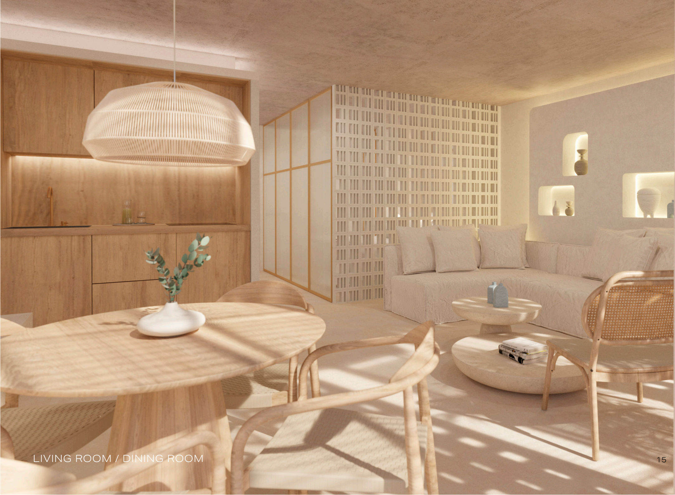
LIVING ROOM / DINING ROOM