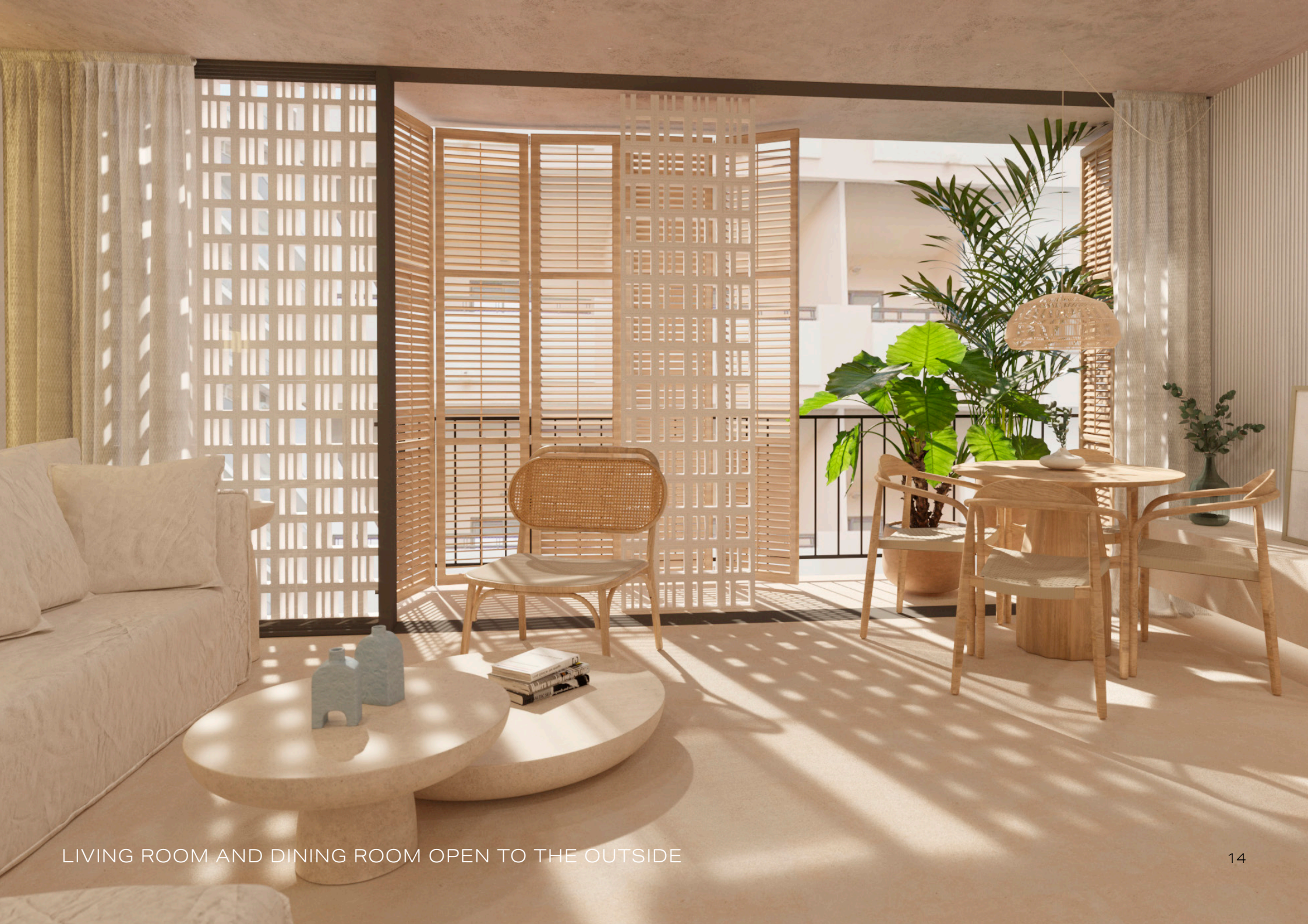
LIVING ROOM AND DINING ROOM OPEN TO THE OUTSIDE