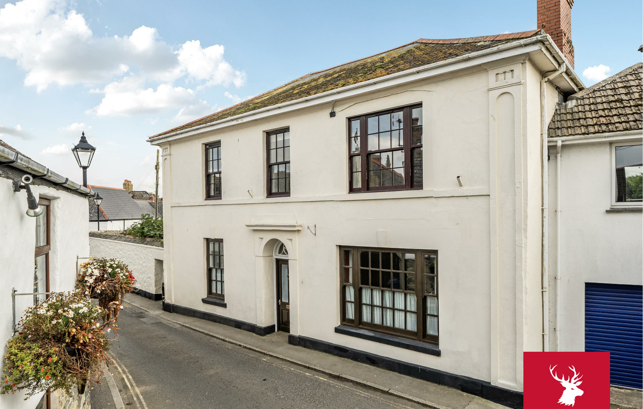
Parc Wartha House