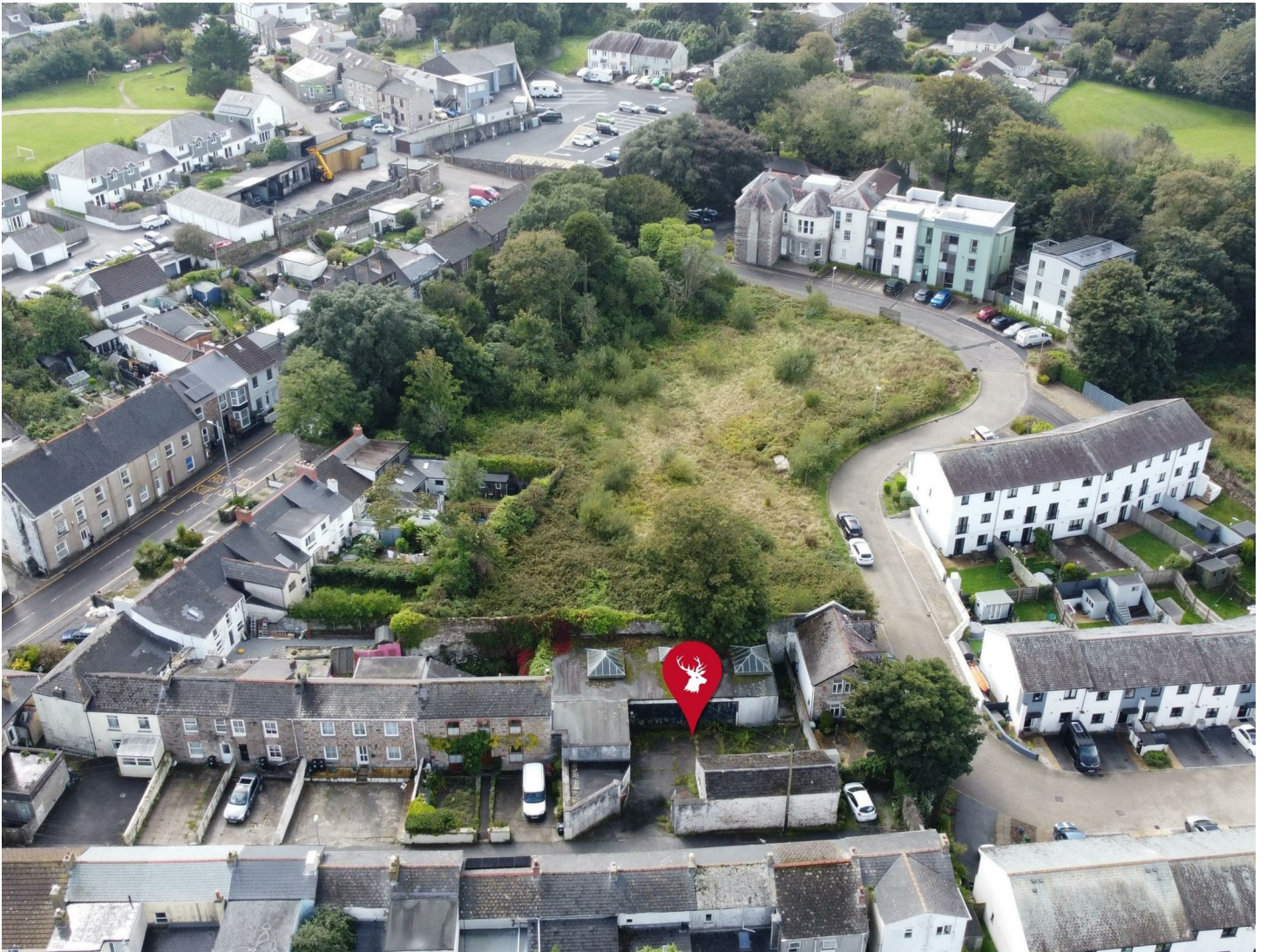
West End Workshop