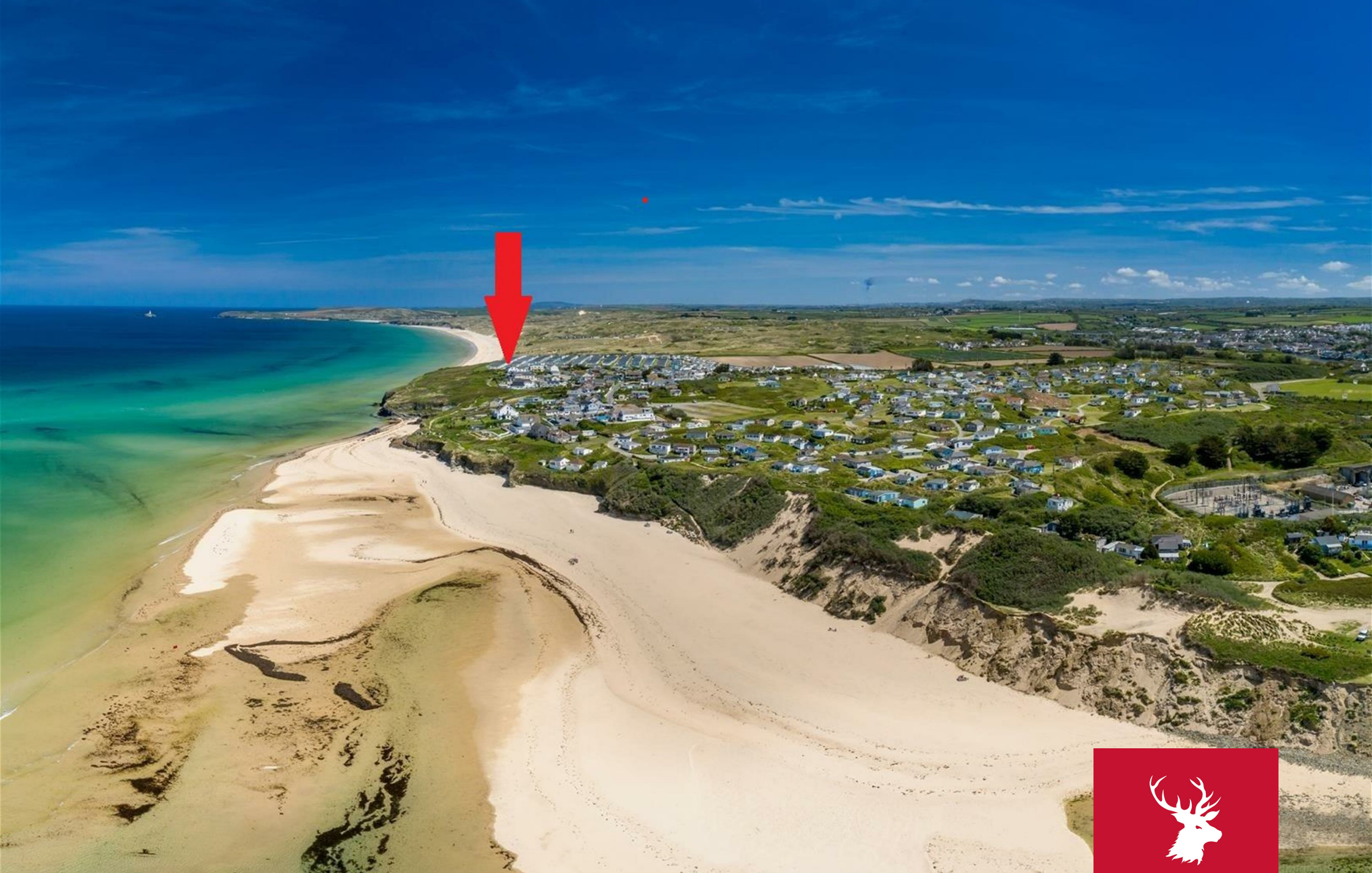
The Big Beach House