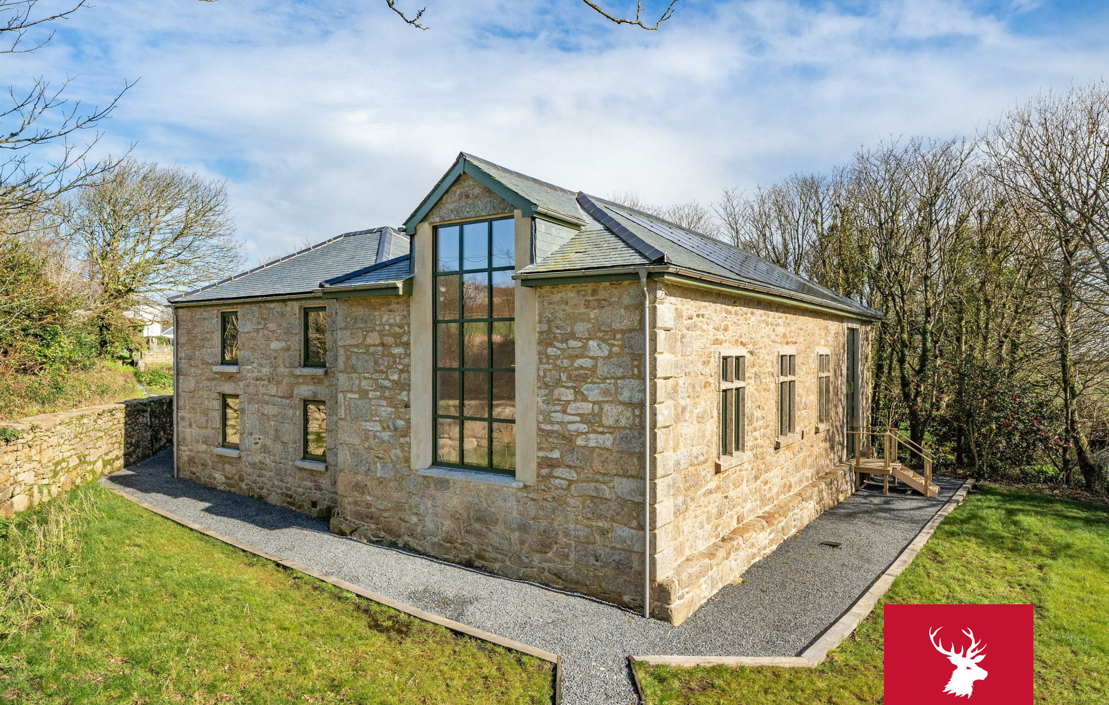
The School House