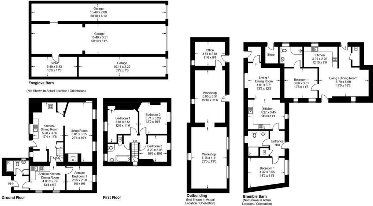
Illustration for identification purposes only, measurements are approximate, not to scale. floorplansUsketch.com © (ID1133281)

Approximate Gross Internal Area = 224.1 sq m / 2412 sq ft (Including Garages & Excludes Store) Annexe = 28.1 sq m / 303 sq ft Bramble / Foxglove Barn = 118.1 sq m / 1271 sq ft Outbuilding = 64.1 sq m / 691 sq ft Total = 434.4 sq m / 4677 sq ft