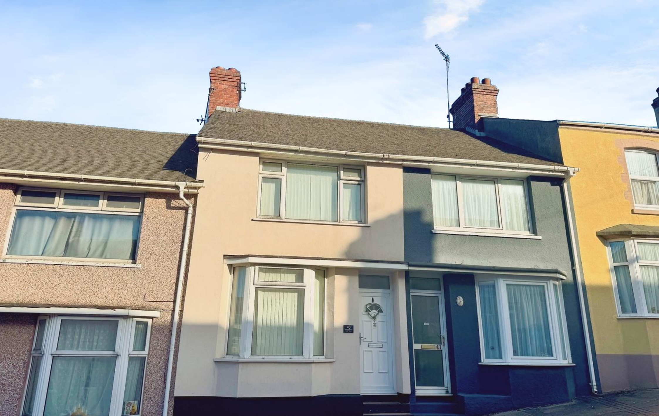
Glenmore Avenue, Keyham, Plymouth