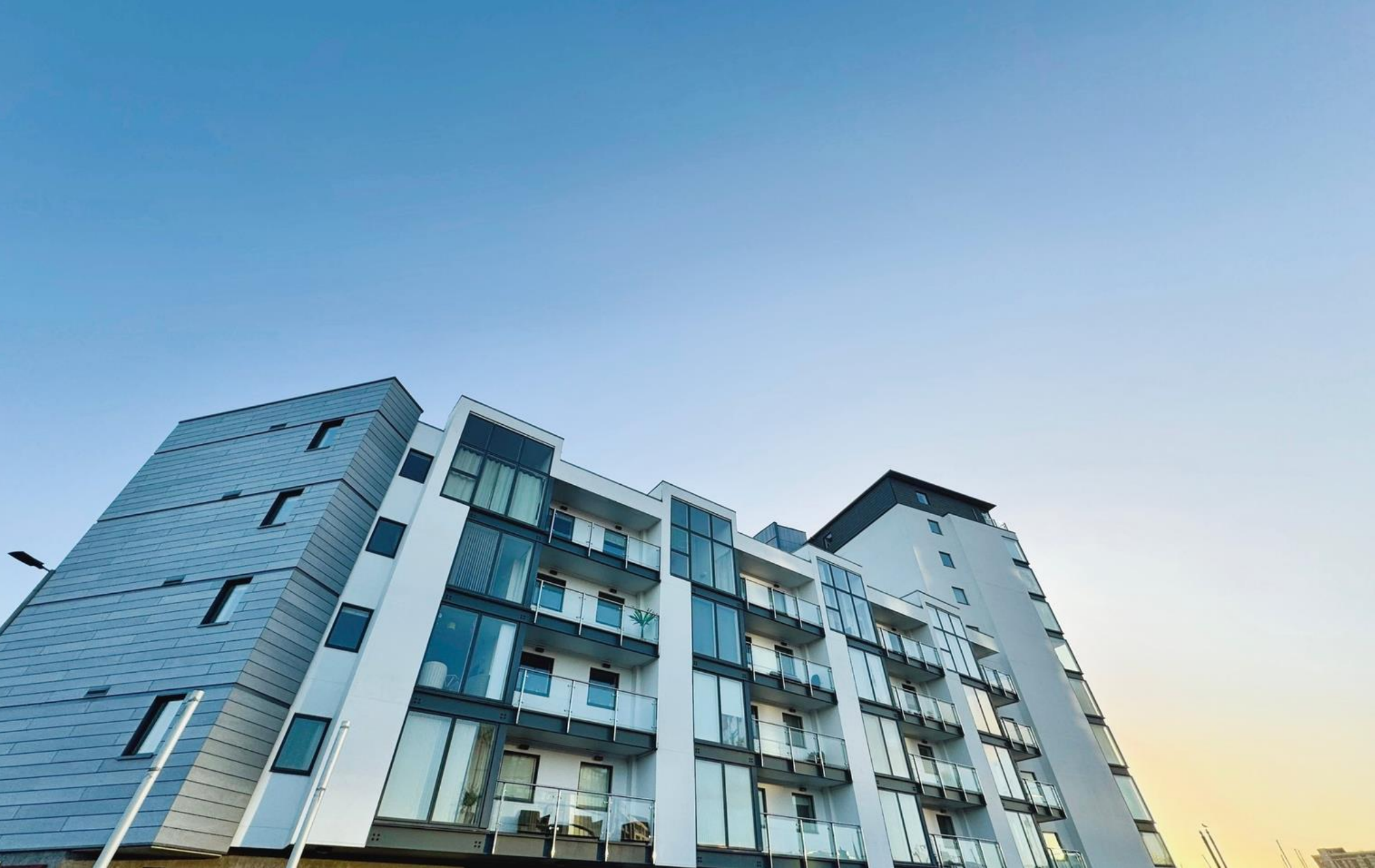
Flat 4, East Quay House, Barbican, Plymouth