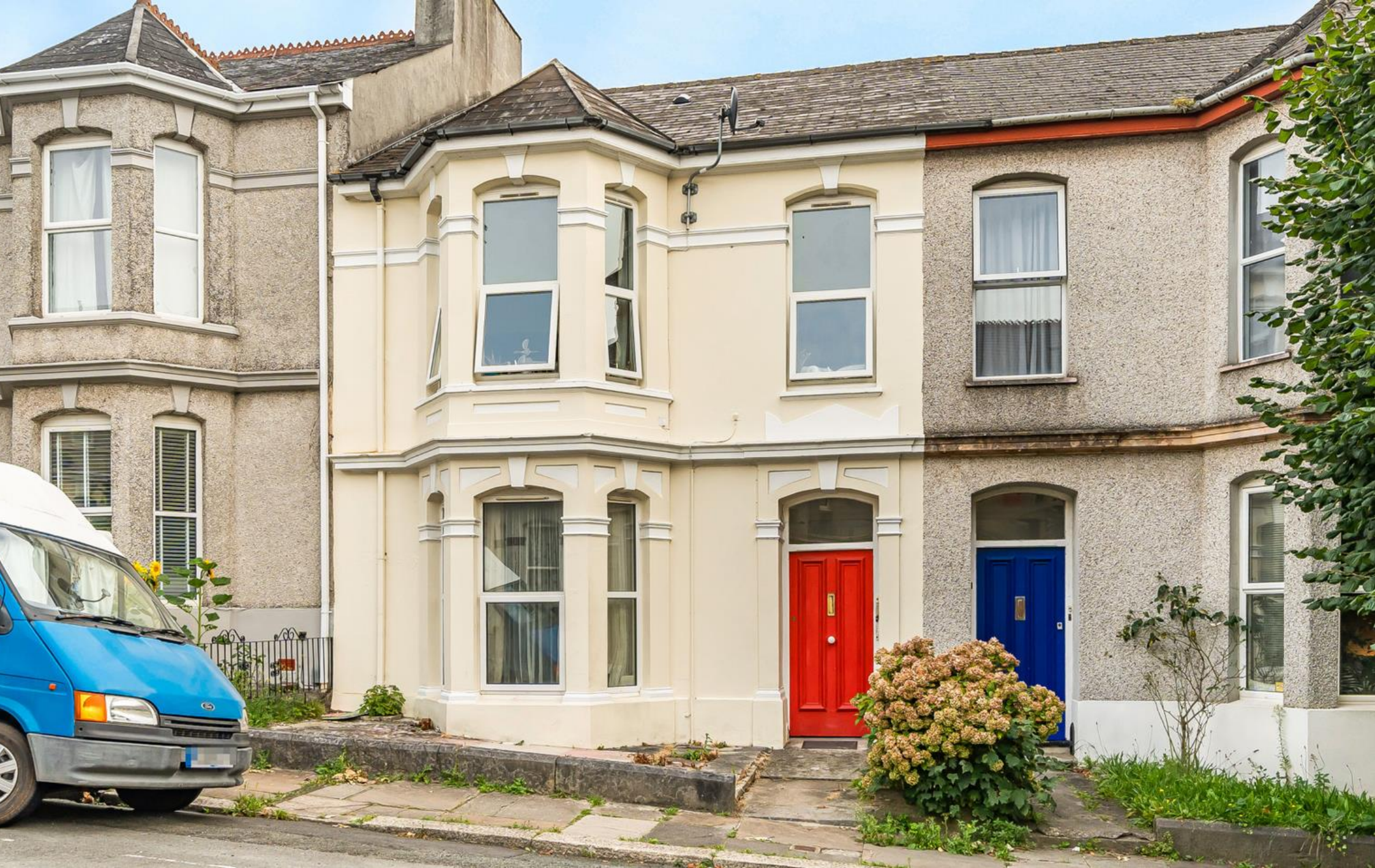
May Terrace, St Judes, Plymouth