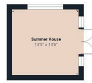
Floor 0 Building 4