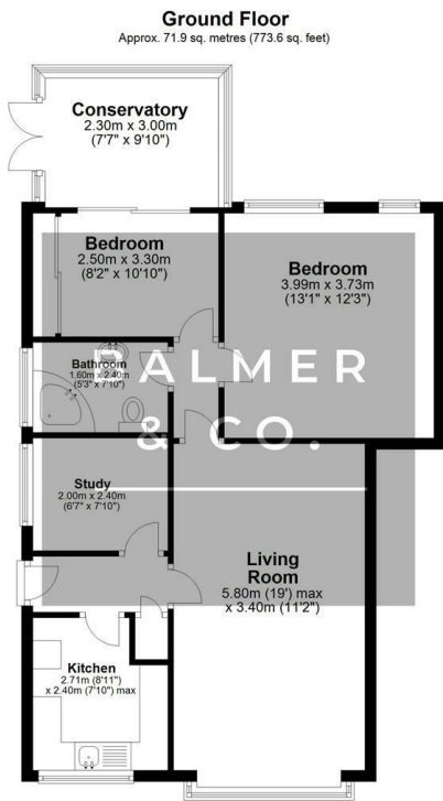
Total area: approx. 71.9 sq. metres (773.6 sq. feet)

BALMER & CO in TYLDESLEY are delighted to offer FOR SALE this detached true bungalow situated in a popular and well regarded residential location. Offered with no onward chain this property comprises in brief of entrance hallway, large living/dining room with electric fireplace and surround, fitted kitchen, conservatory with insulated ceiling, extended master bedroom with fitted wardrobes, second double bedroom, third single bedroom, with a three piece bathroom completing the accommodation on offer. Externally the property occupies a generous, low maintenance plot with a garden frontage, long driveway, fully enclosed South-facing rear garden and a detached single garage. Early viewings highly recommended, all enquires welcome.