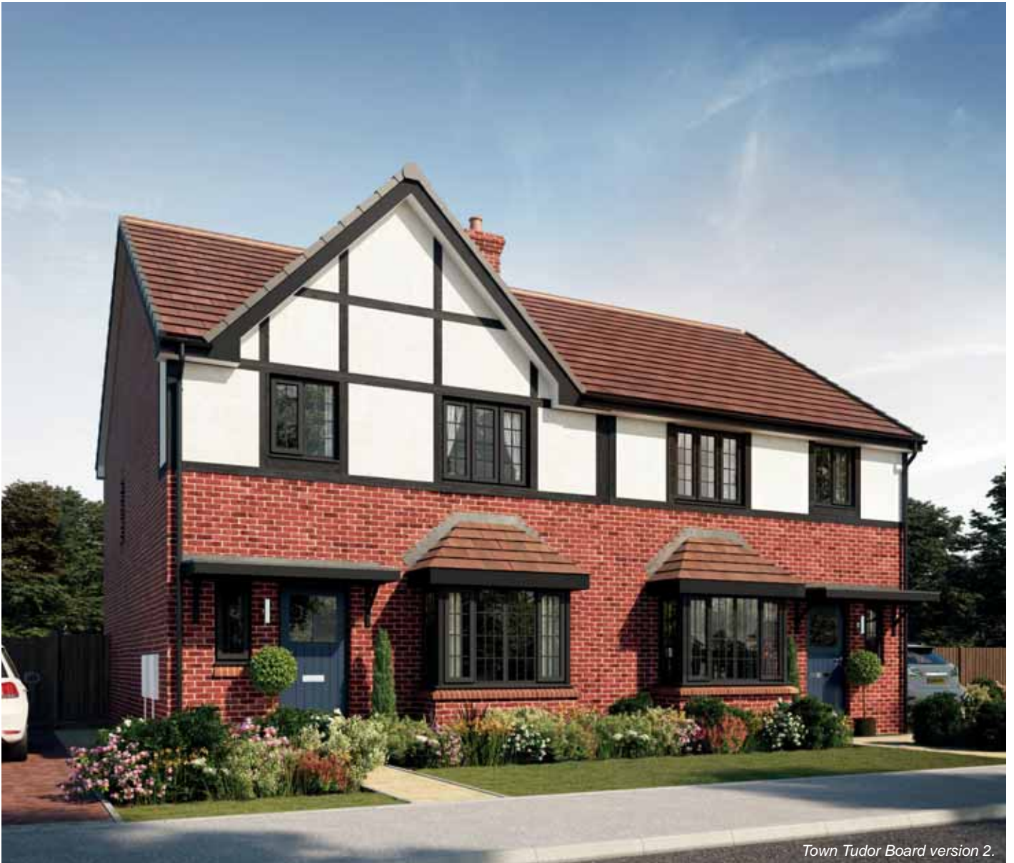
Town Tudor Board version 2.