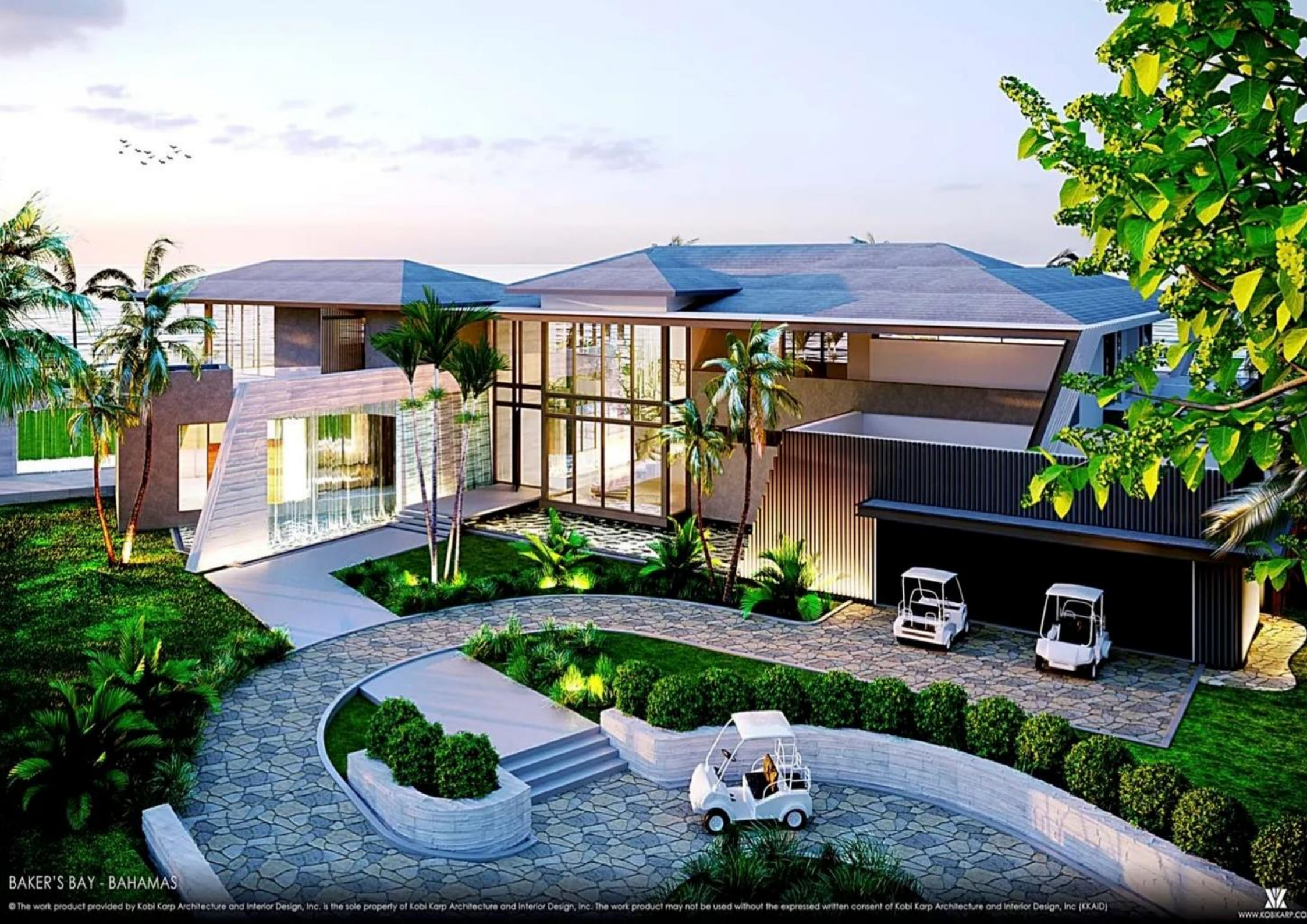
BAKER'S BAY - BAHAMAS

© The work product provided by Kobi Karp Architecture and Interior Design, Inc. is the sole property of Kobi Karp Architecture and Interior Design, Inc. The work product may not be used without the expressed written consent of Kobi Karp Architecture and Interior Design, Inc. (KKAID)