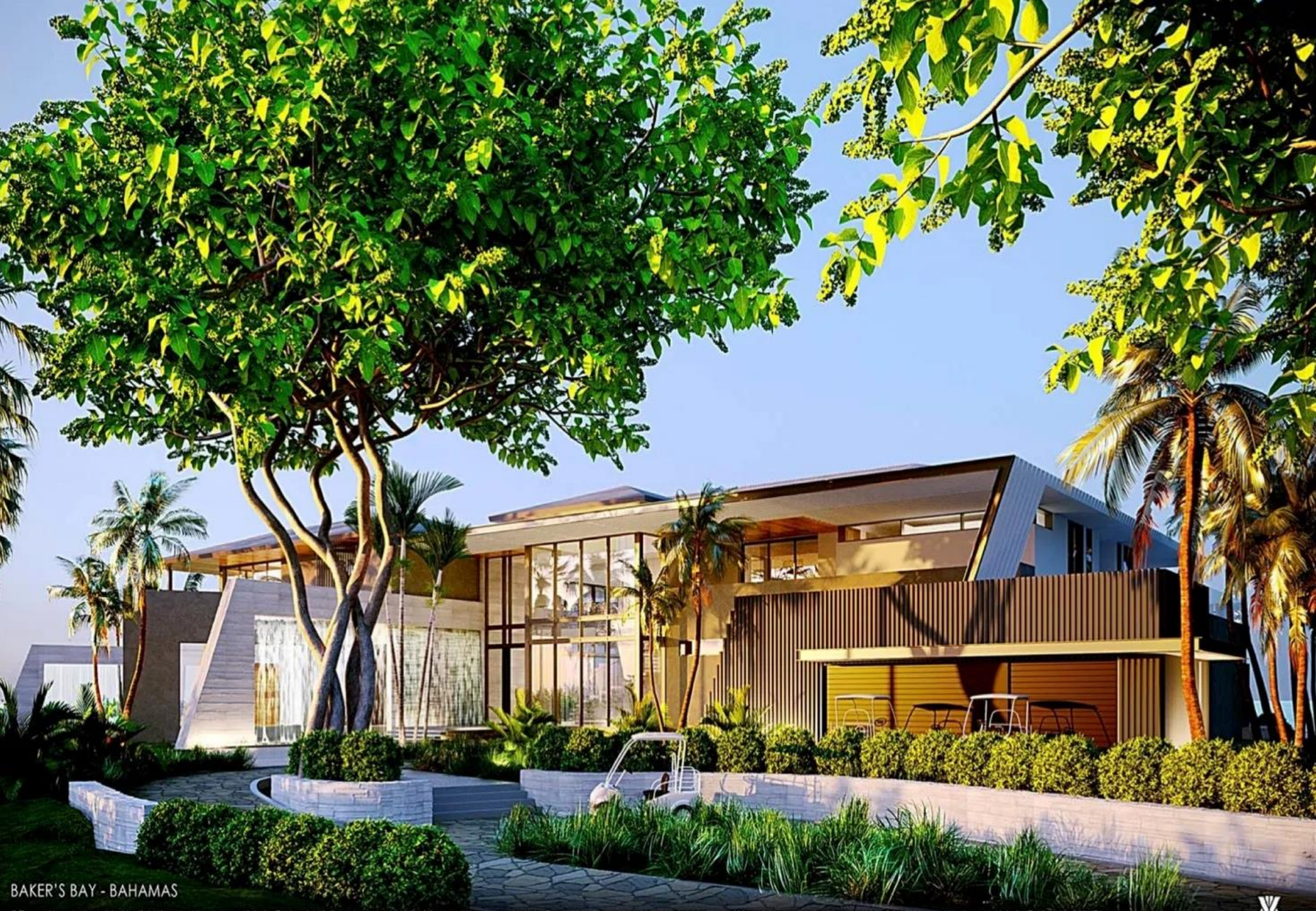
BAKER'S BAY - BAHAMAS

© The work product provided by Kobi Karp Architecture and Interior Design, Inc. is the sole property of Kobi Karp Architecture and Interior Design, Inc. The work product may not be used without the expressed written consent of Kobi Karp Architecture and Interior Design, Inc. (KKAID)