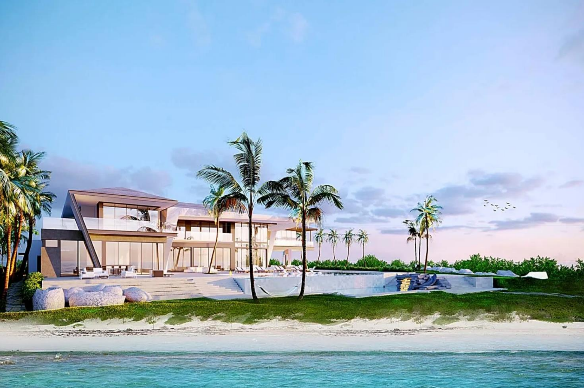
BAKER'S BAY - BAHAMAS