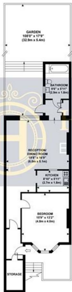
BASEMENT FLOOR GROSS INTERNAL FLOOR AREA 836 SQ FT