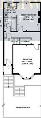
GROUND FLOOR GROSS INTERNAL FLOOR AREA 586 SQ FT