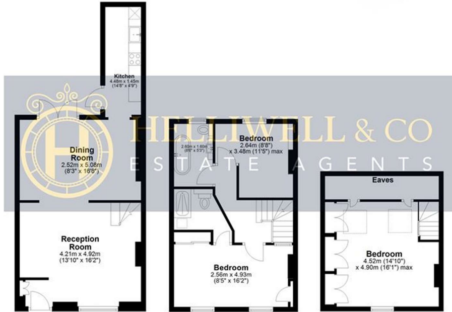
Ground Floor Approx. 40.6 sq. metres (437.5 sq. feet)