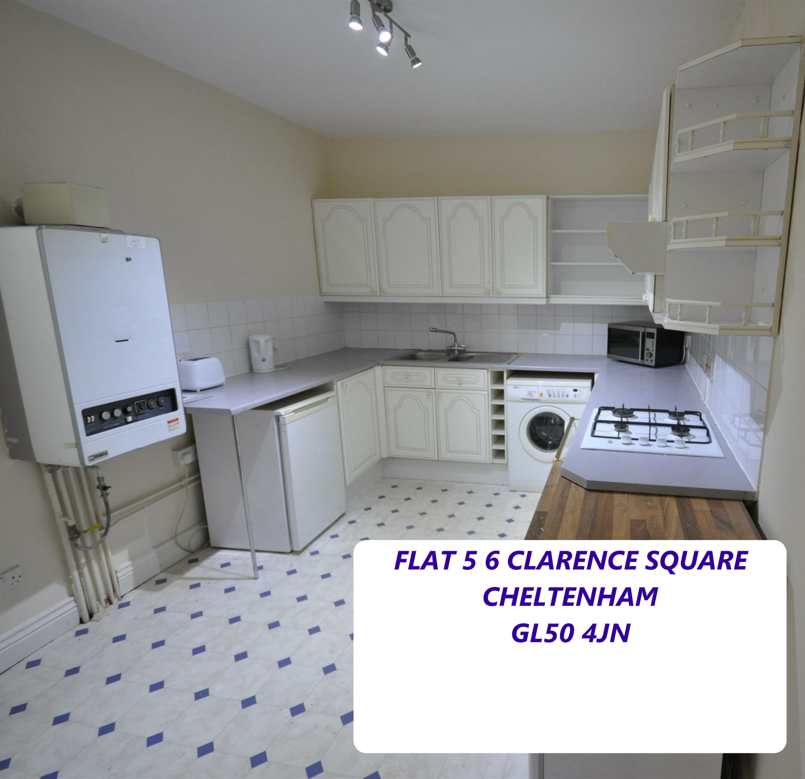
FLAT 5 6 CLARENCE SQUARE CHELTENHAM GL50 4JN