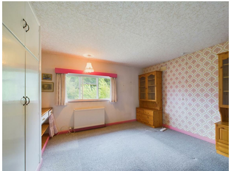
Window to rear, radiator, built in wardrobes and cupboards.