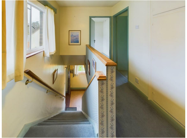
Window to front, electric heater, loft access, built in cupboard.