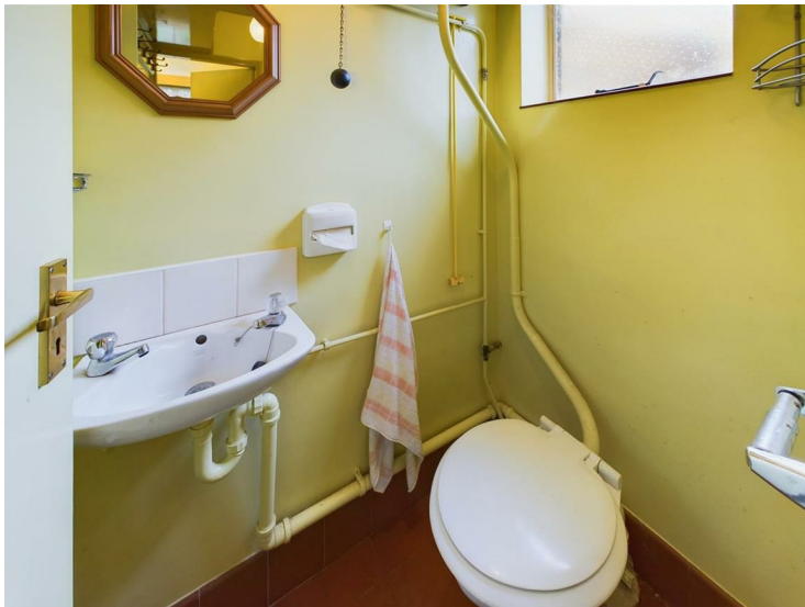
With WC and wash hand basin.