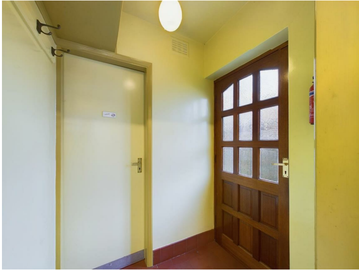
Tiled floor and door to rear.