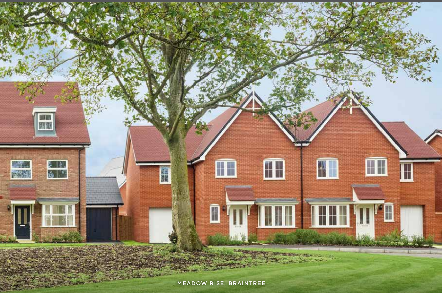
MEADOW RISE, BRAINTREE