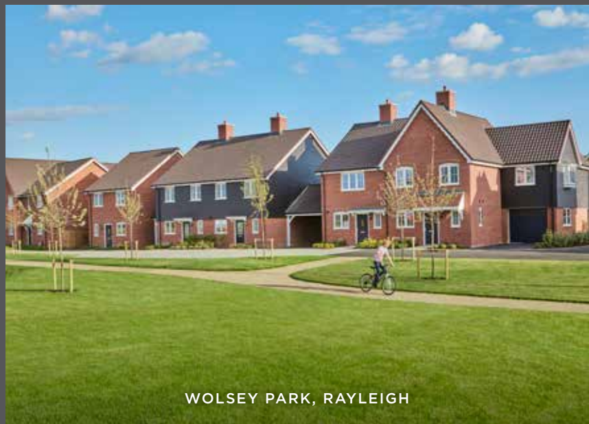
WOLSEY PARK, RAYLEIGH