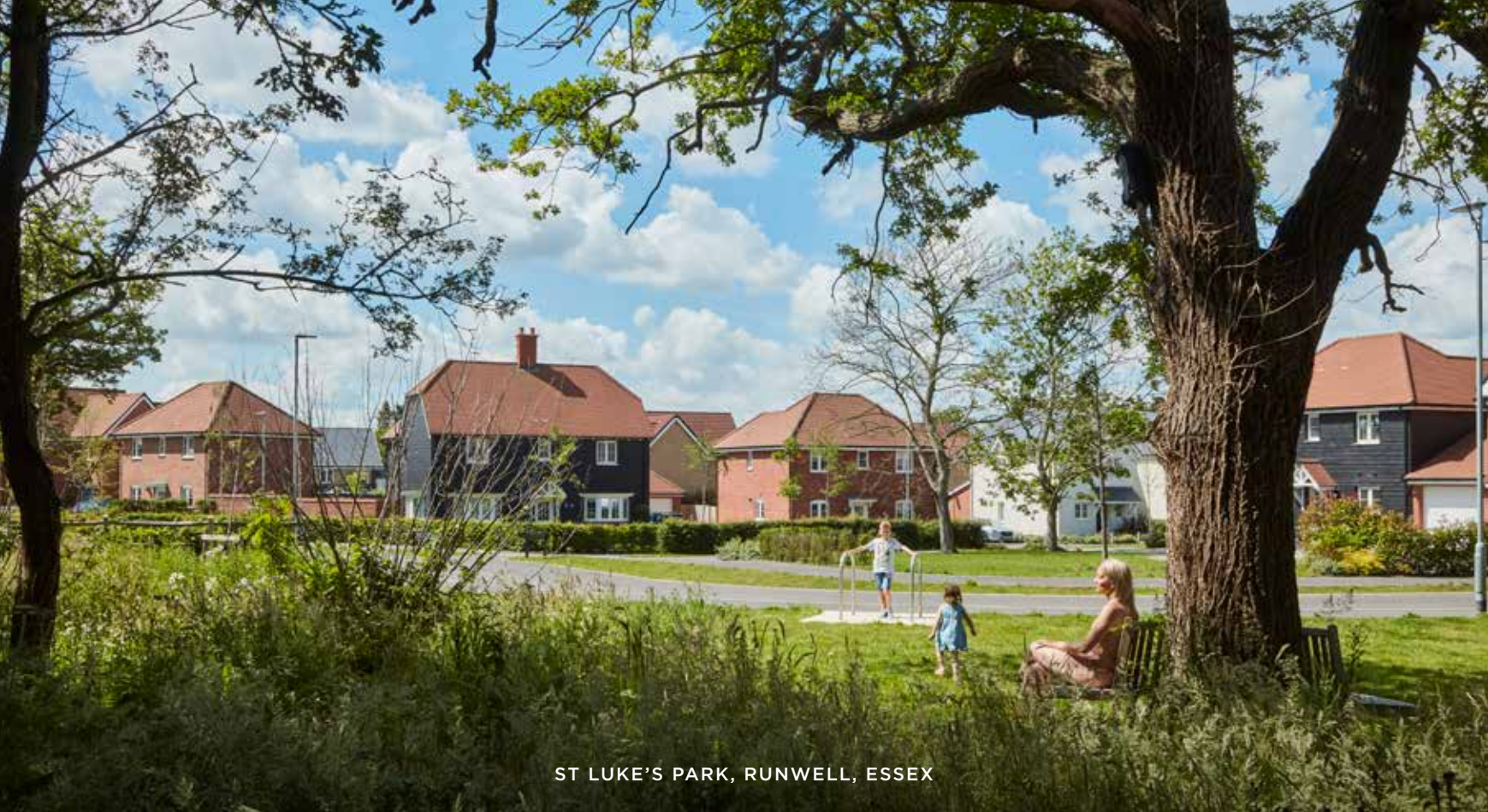
ST LUKE'S PARK, RUNWELL, ESSEX