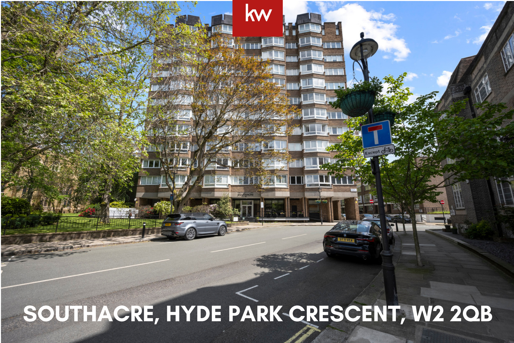
SOUTHACRE, HYDE PARK CRESCENT, W2 2QB