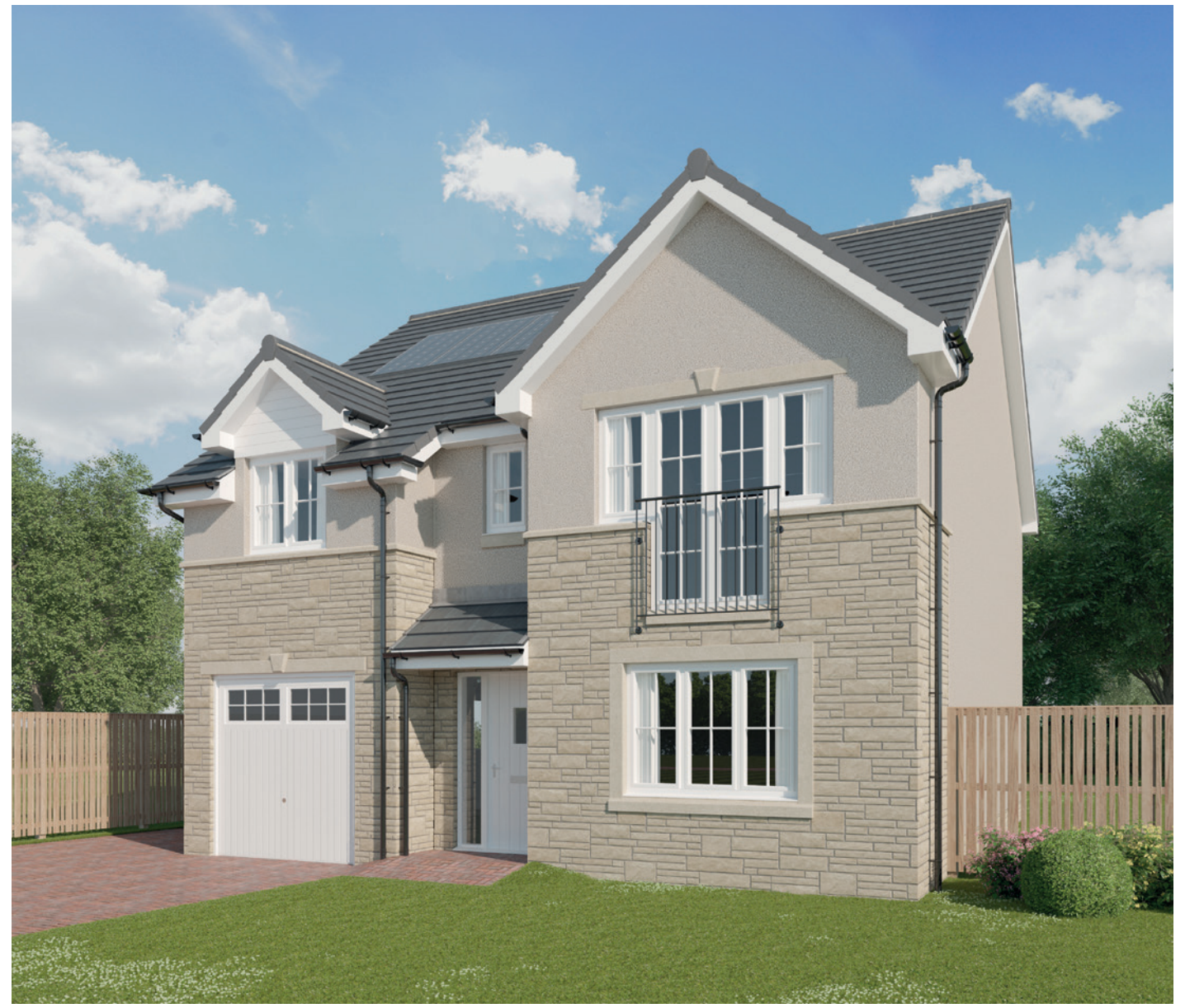
Please \ note \ Photo \ Voltaic \ (solar) \ panels \ shown \ above \ are \ indicative \ only. \ The \ location \ and \ number \ of \ panels \ are \ dependent \ on \ plot \ orientation. \ Please \ see \ Sales \ Advisor \ for \ details.

Bellway Homes Limited (Scotland East) 6 Almondvale Business Park Almondvale Way, Livingston, West Lothian EH54 6GA