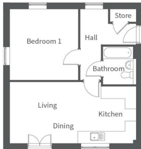
Plots 35, 37 & 39