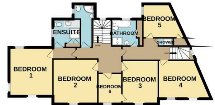
TOTAL FLOOR AREA : 3900 sq.ft. (362.3 sq.m.) approx.

Whilst every attempt has been made to ensure the accuracy of the floorplan contained here, measurements of doors, windows, rooms and any other items are approximate and no responsibility is taken for any error, omission or mis-statement. This plan is for illustrative purposes only and should be used as such by any prospective purchaser. The services, systems and appliances shown have not been tested and no guarantee as to their operability or efficiency can be given. Made with Metropix ©2025