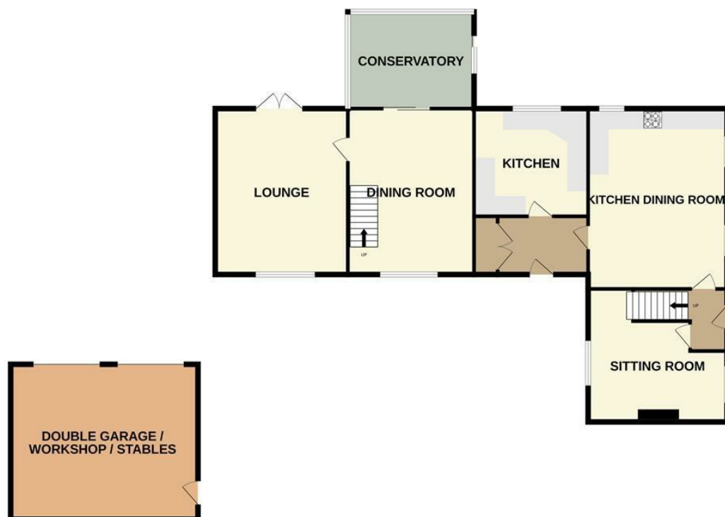
GROUND FLOOR 1667 sq.ft. (154.8 sq.m.) approx.