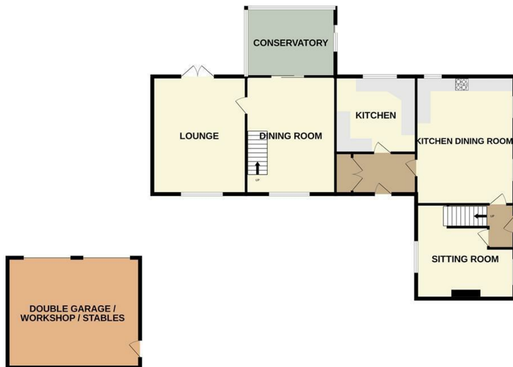
GROUND FLOOR 1667 sq.ft. (154.8 sq.m.) approx.