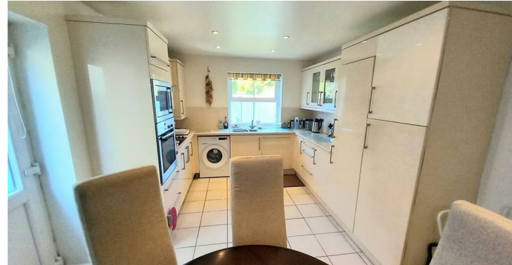
3 Bedroomed Coastal Bungalow

5 Pebble Close, Westward Ho, Bideford, EX39 1FD