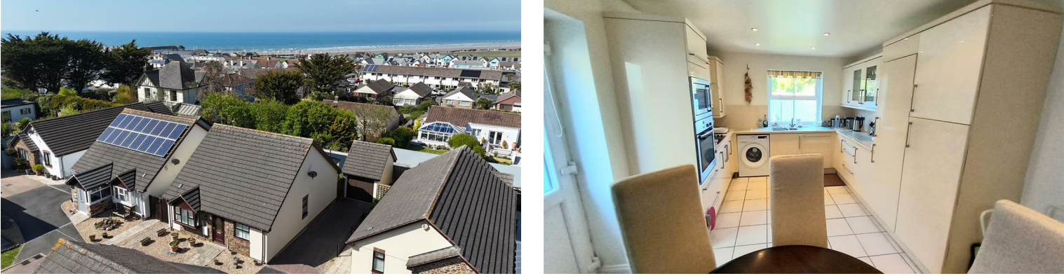
3 Bedroomed Coastal Bungalow 5 Pebble Close, Westward Ho, Bideford, EX39 1FD