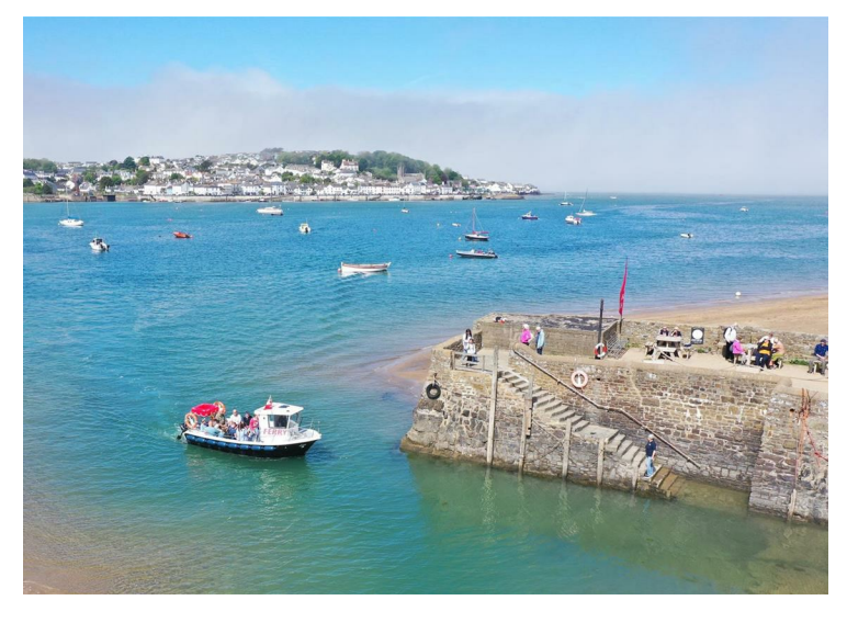
The property is superbly located within the centre of the village of Instow;

Instow's maritime character is amplified by the presence of colourful fishing boats bobbing gently in the harbour. Boasting a glorious sandy riverside beach, backed by dunes, Instow is popular among families and water-sports enthusiasts alike.