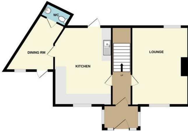
GROUND FLOOR 702 sq.ft. (65.2 sq.m.) approx.