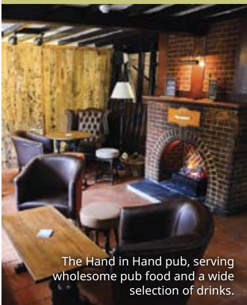
The Hand in Hand pub, serving wholesome pub food and a wide selection of drinks.