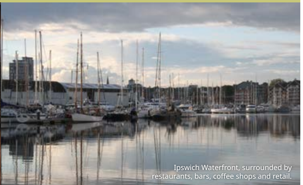
Ipswich Waterfront, surrounded by restaurants, bars, coffee shops and retail.