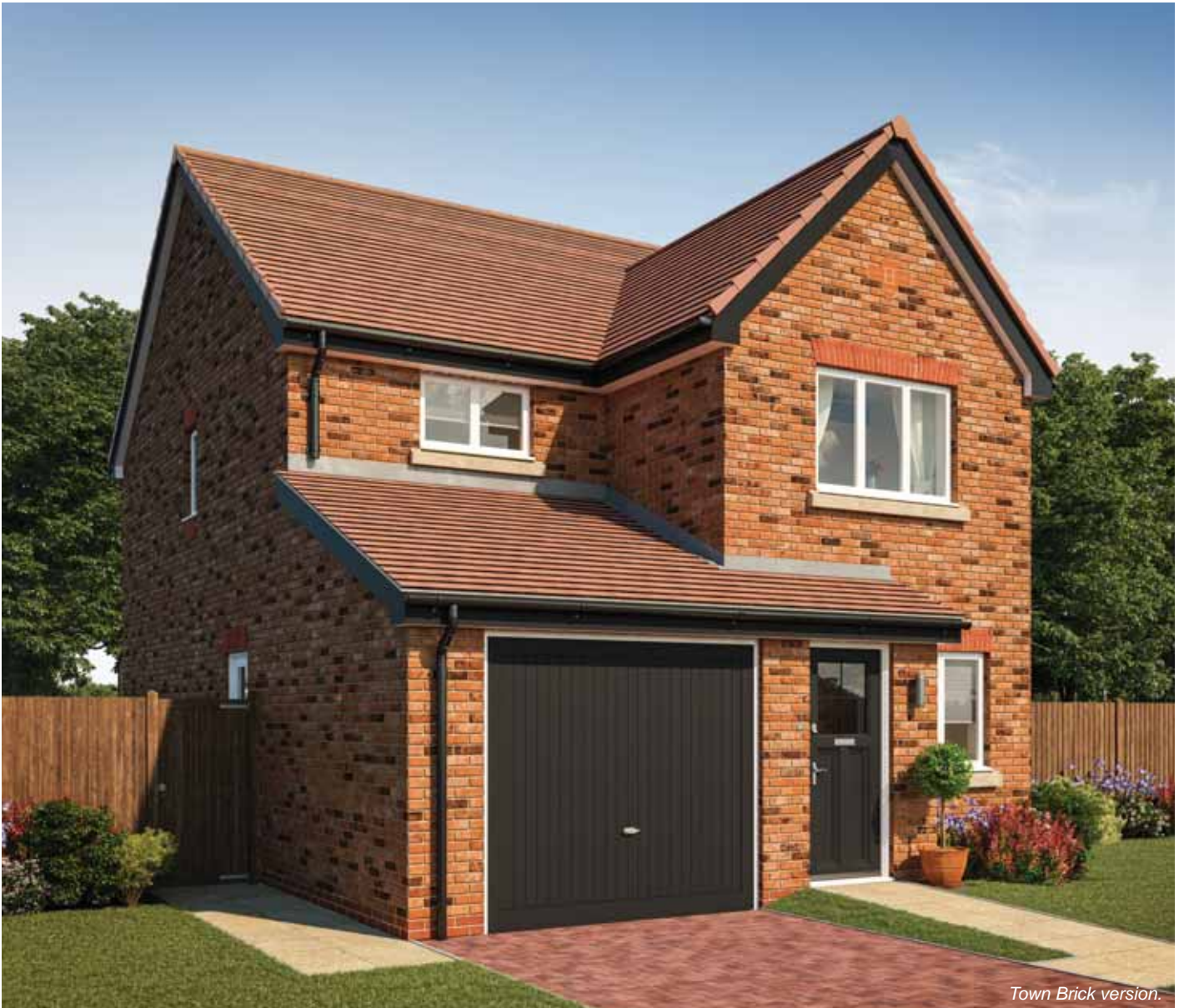
Town Brick version.