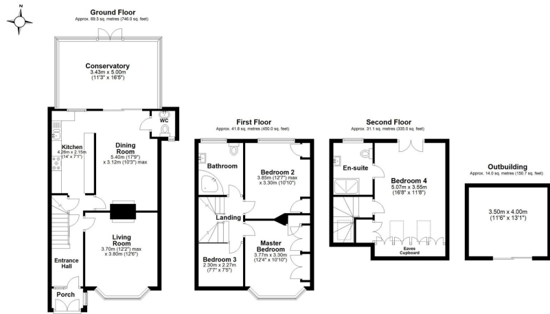
Total area: approx. 156.2 sq. metres (1681.8 sq. feet) Broadview Avenue