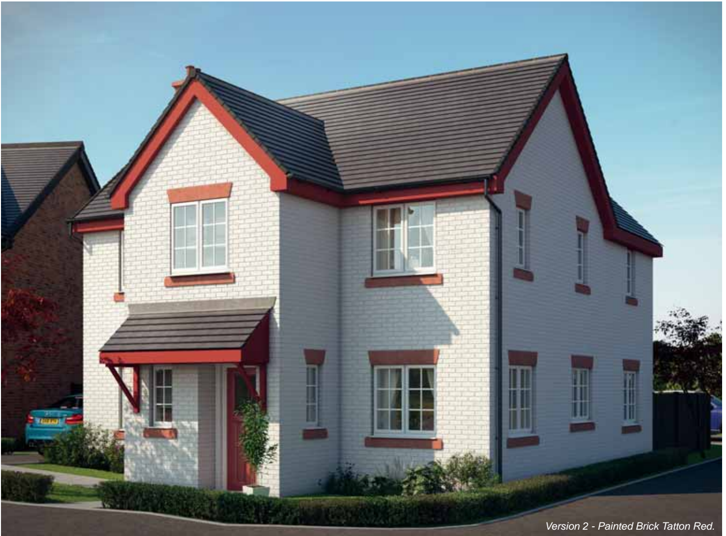
Version 2 - Painted Brick Tatton Red.